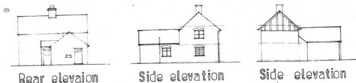
Original elevations (pre 1948)

5.10 The original elevations and floor plans i.e. pre 1948 are set out below to assist Members in their assessment of whether the proposed extensions represent disproportionate extensions, over and above the original house. In addition, the proposed ground floor plan is laid out next to the original to show original rear walls and the remaining potential (hatched) for single storey rear extensions under permitted development. For information the remaining (un-hatched) area of the proposed rear extension would constitute an extension extending 8.2m beyond the line of an original rear wall.